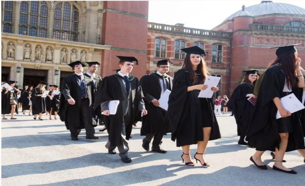
Graduates at Birmingham University.