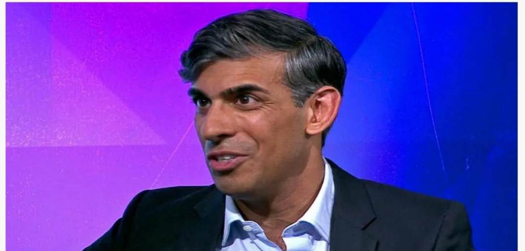
Former Prime Minister Rishi Sunak

AI is already leading to fewer jobs for young people, says Sunak